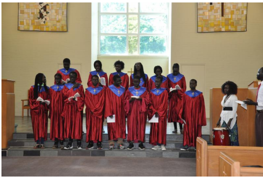
Sudanese Youth Choir

We were honored and excited to have about 20 of the Sudanese Youth Choir from Gallatin participate in the worship service to sing and raise praise to the Lord with their beautiful young voices.