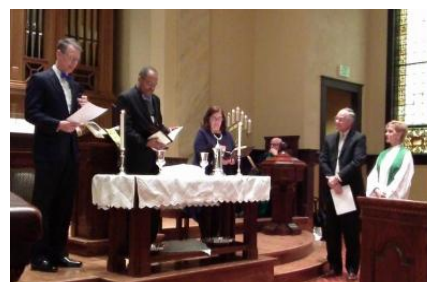
Installation of 2018 Moderator and Vice-Moderator